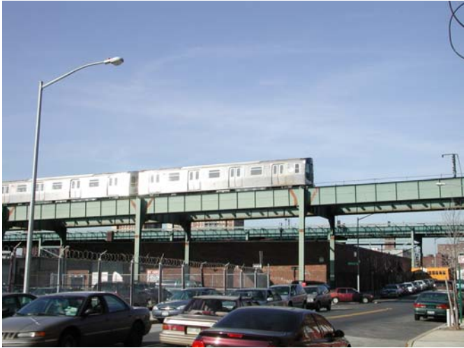
R-143 8281 south of Atlantic Avenue.

is the portion that was supposed to be torn down that weekend (and, before that, Presidents' Day weekend — see February, 2003 issue). It was not torn down, and it has not been torn down yet. It will be torn down, eventually.