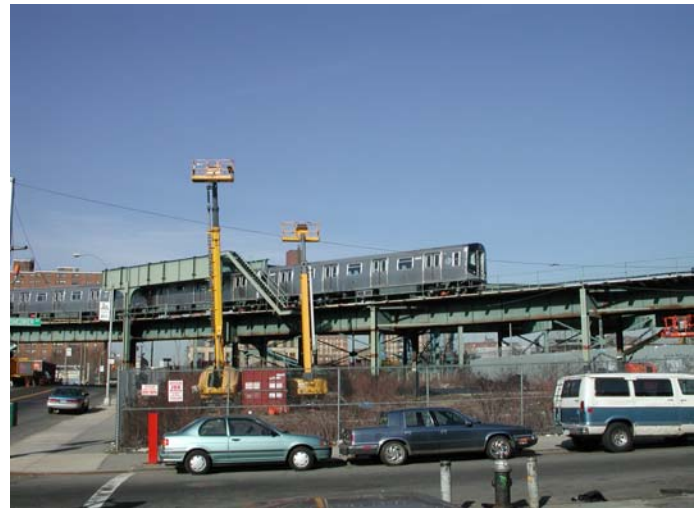
R-143 8305 north of Sutter Avenue.