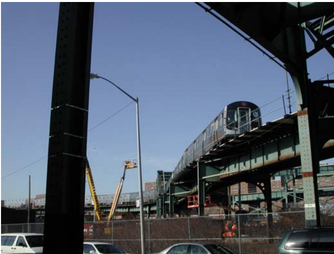
Train of R-143s north of Sutter Avenue.