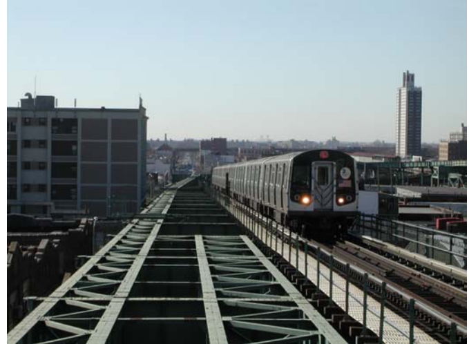
Train of R-143s south of Atlantic Avenue.